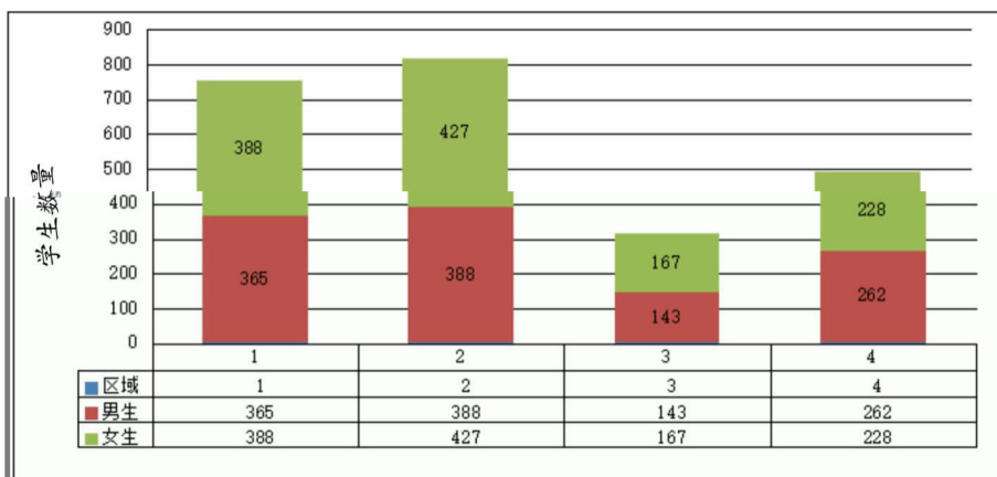
图一 毛里求斯小学学习汉语的学生数量 5